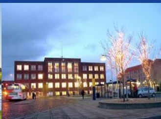
Korsør Old Townhall